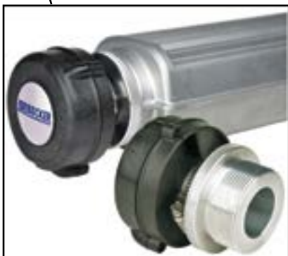
Part No. 74000600100A-BPC

Becker Reduces Dust, Becker Reduces Downtime!