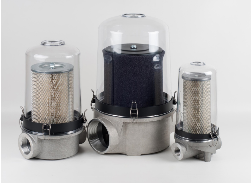
Image shows Becker Clear Filters. High resolution available for download at http://beckerpumps.com/media